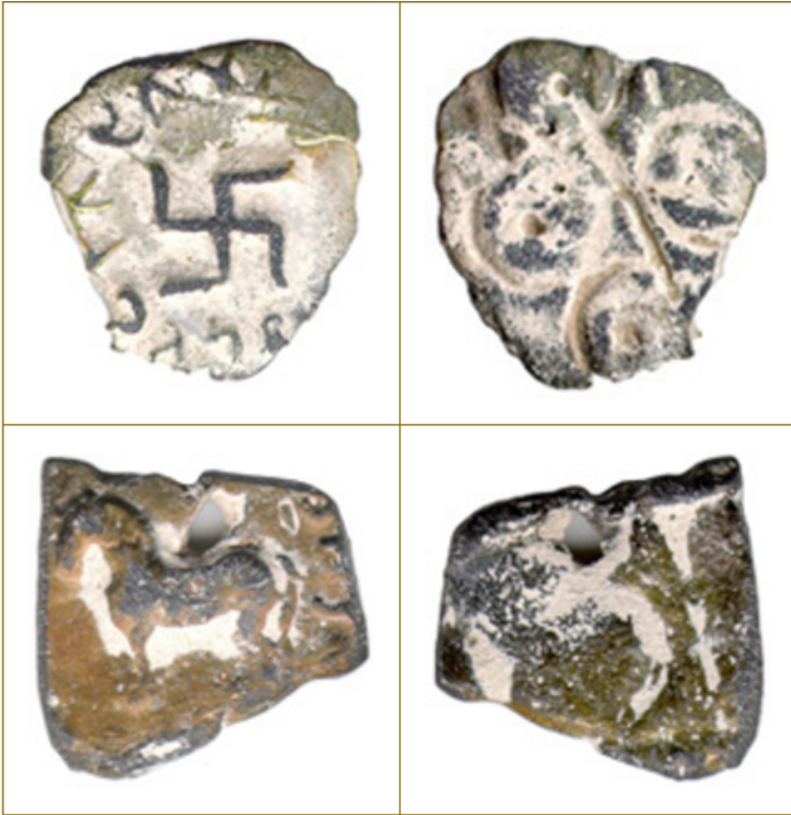
Coins of the Satavahana