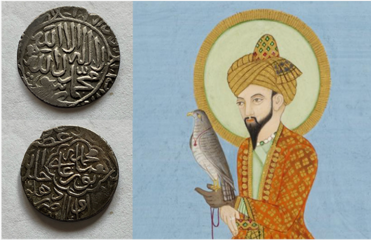
Silver Shahrukhi issued by Humayun from the Delhi mint