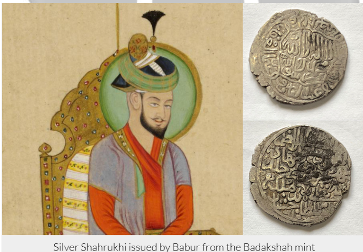
Silver Shahrukhi issued by Babur from the Badakshah mint