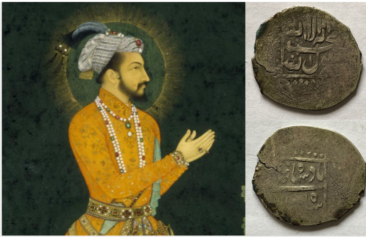
Silver mishqal issued by Shah Jahan—this denomination was discontinued during his reign