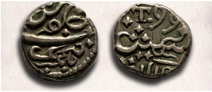
One-tenth silver rupee issued by the East India Company in the name of Alamgir II from Tellicherry mint