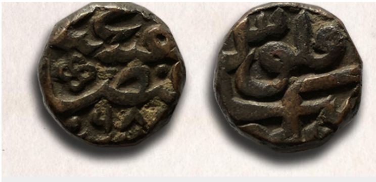
Copper daam issued by Akbar from the Bhakkar mint