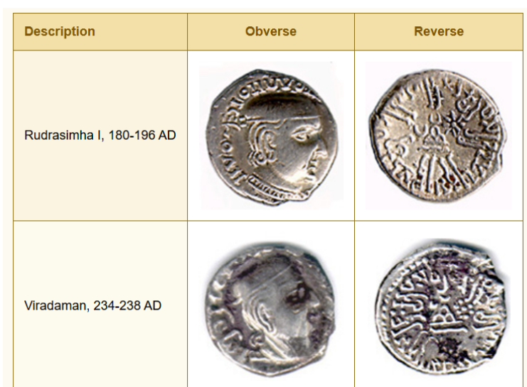
Coins of the Western Kshatrapas