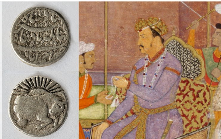
Zodiac coin (Taurus) issued by Jahangir