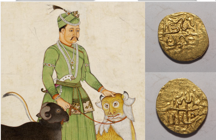
One-tenth gold mohur issued by Akbar