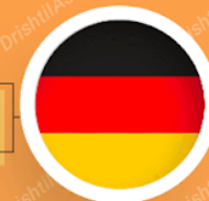
Weimar Constitution of Germany