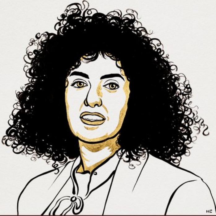
Illustration: Niklas Elmehed