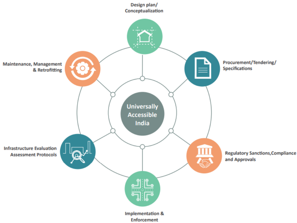
Holistic Framework for Universal Accessibility Implementation