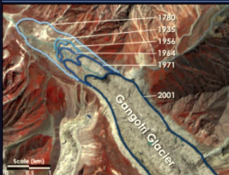
Earth Observatory February 28, 2016

Global temperature increase negatively affects the atmosphere.