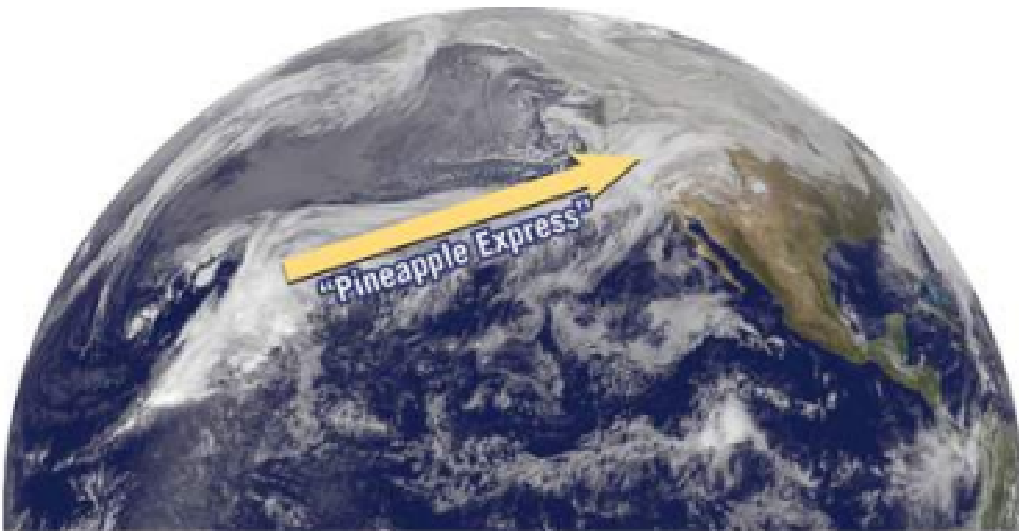
Satellite image of clouds over the Pacific Ocean illustrating the "Pineapple Express," a phenomenon in which a strong jet stream carries mT air from as far away as Hawaii to the West Coast.