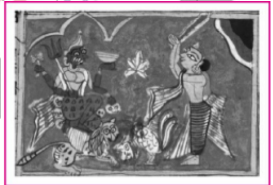
Apabhramsa school of art