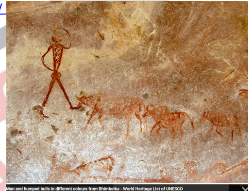
Man and humped bulls in different colours from Bhimbetka - World Heritage List of UNESCO