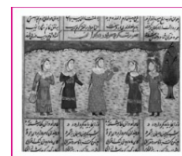
Transition period miniature