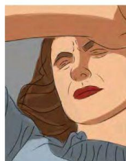
Sensitivity to light