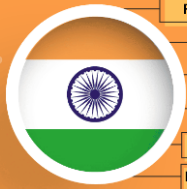
Government of India Act of 1935