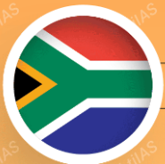
South African Constitution