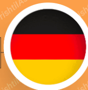
Weimar Constitution of Germany