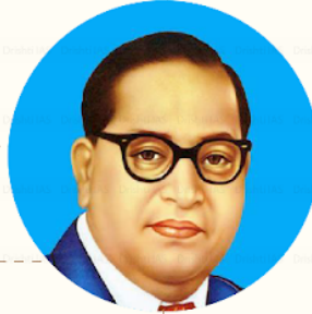
Babasaheb Ambedkar- The Father of Indian Constitution