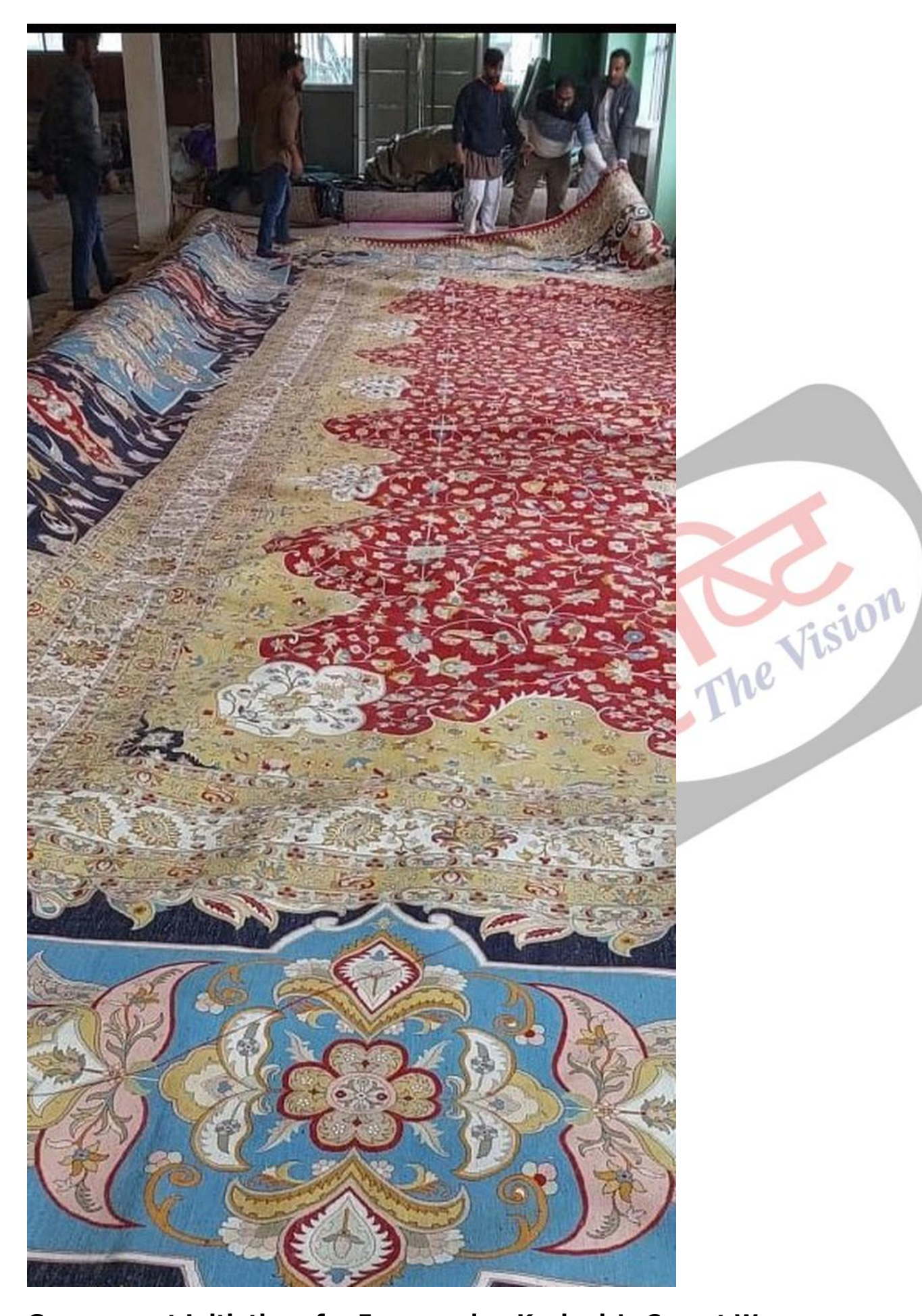
Government Initiatives for Empowering Kashmir's Carpet Weavers: