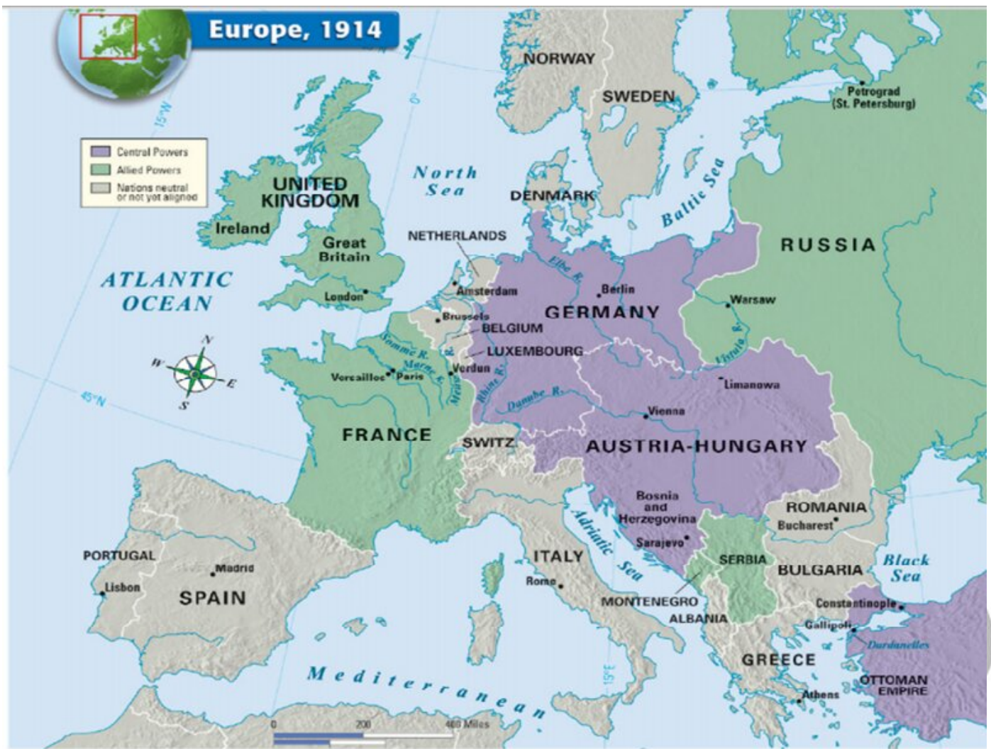
Fig: Alliances at the beginning of the War