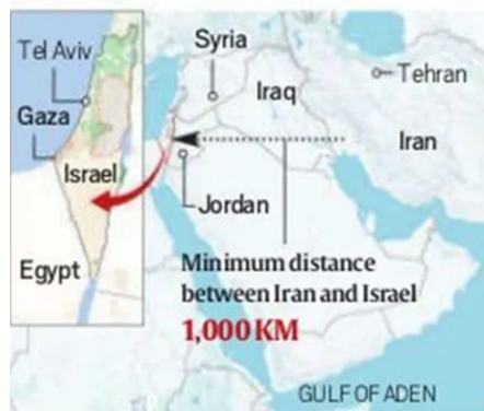
Illustration: Suvajit Dey; Photos: Reuters, Rafael Advanced Defence Systems; Information: AP, Rafael, CSIS

Family of multirange mobile air defence systems to defend large areas against aerial attacks by fighter and bomber aircraft, helicopters, cruise missiles, UAVs. All-weather system can be activated within seconds of a target being declared hostile, according to the manufacturer Rafael. (above)