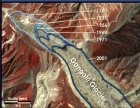
Earth Observatory February 28, 2016

Global temperature increase negatively affects the atmosphere.