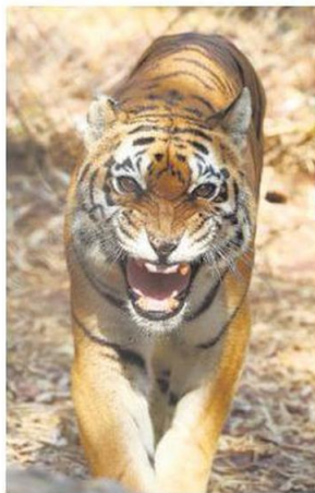
Steady rise: A tiger at Van Vihar National Park in Bhopal on Sunday.