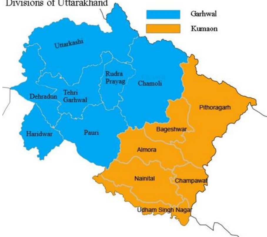
Divisions of Uttarakhand