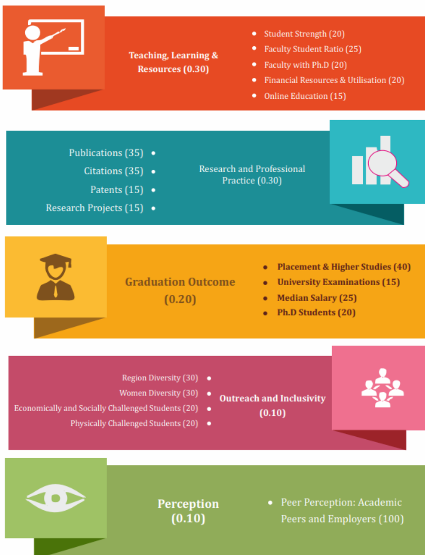
Fig. 1: NIRF Parameters for Ranking of Institutions