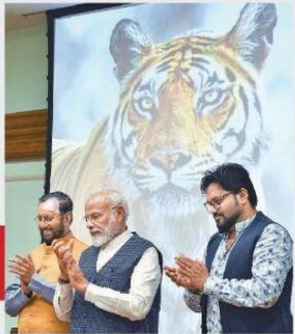
Prime Minister Narendra Modi, with Ministers Prakash Javadekar and Babul Supriyo, at the release of the results of 4th cycle of All India Tiger Estimation in New Delhi.

While tiger occupancy has increased in Madhya Pradesh and Andhra Pradesh, it has seen a sharp decline in Chhattisgarh since 2014 and has stagnated for Odisha