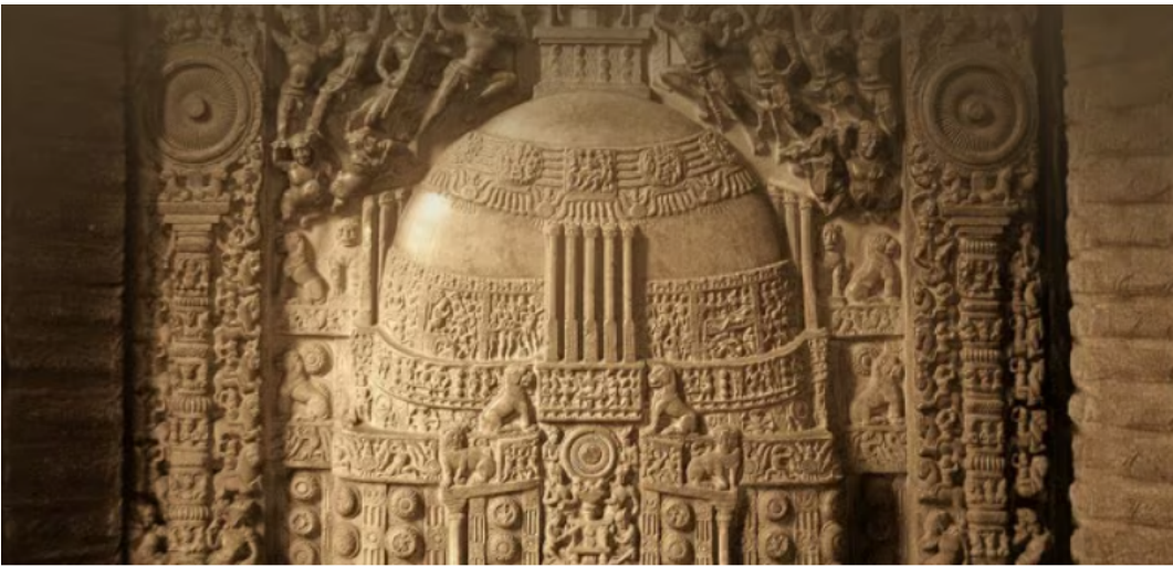
Amaravathi Stupa is the largest Buddhist stupa in South Asia.