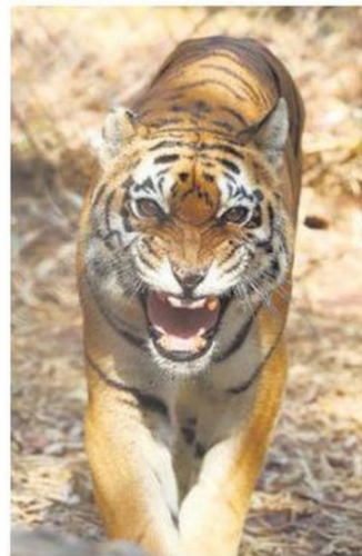
Steady rise: A tiger at Van Vihar National Park in Bhopal on Sunday.