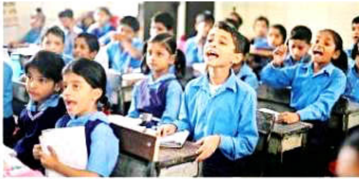
Class in progress: Survey captures Covid disruptions.