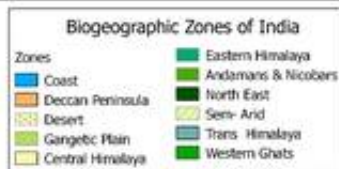
SKINK SPECIES DISTRIBUTION IN DIFFERENT BIOGEOGRAPHIC ZONES OF INDIA (ENDEMIC SPECIES IN BRACKETS)