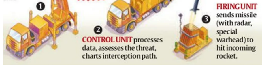
Illustration: Suvajit Dey; Photos: Reuters, Rafael Advanced Defence Systems; Information: AP, Rafael, CSIS

detects airborne rocket/shell, transmits data to the control unit.