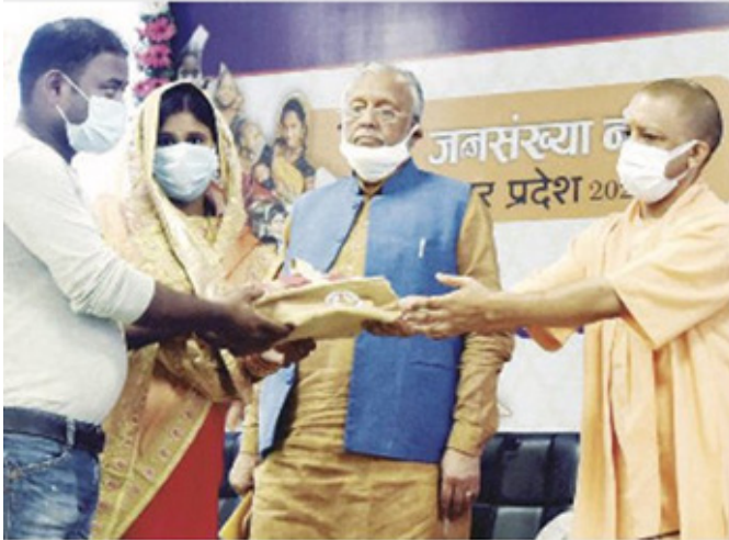
Baby steps: Yogi Adityanath encouraging a newly married couple to opt for family planning in Lucknow on Sunday. ▪

Future planning | The Uttar Pradesh Population Policy 2021-2030 was launched to reduce maternal and infant deaths in a time-bound manner. The policy aims to: