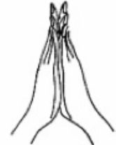
Namaskara Mudra Gesture of greeting, prayer, and adoration. Buddhas no longer make this gesture because they do not have to show devotion to anything.