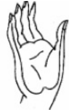
Abhaya Mudra Gesture of reassurance, blessing, and protection. "Do not fear."