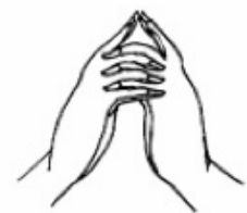
Uttarabodhi Mudra Two hands placed together above the head with the index fingers together and the other fingers intertwined. The gesture of supreme enlightenment.