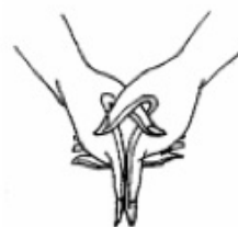
Ksepama Mudra Two hands together in the gesture of 'sprinkling' the nectar of immortality.