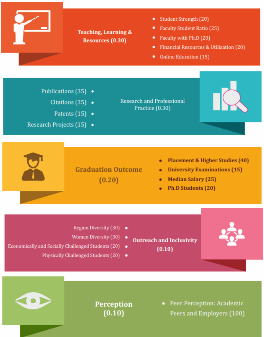
Fig. 1: NIRF Parameters for Ranking of Institutions